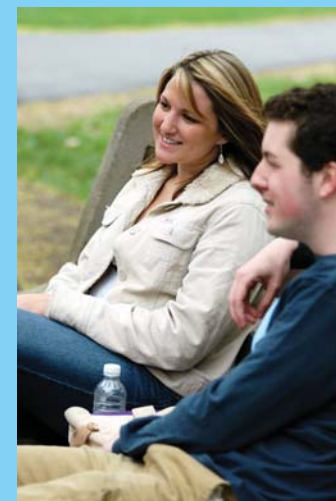
You’ll find the academic opportunities of Penn State in a setting as intimate and comfortable as that of a small college.

About 80 percent are pursuing bachelor’s degrees.