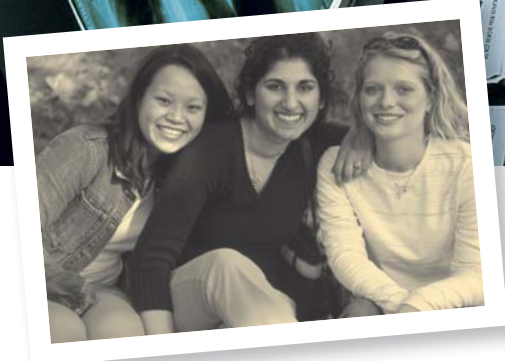
An average of nineteen students per class allows our faculty to interact personally with students.